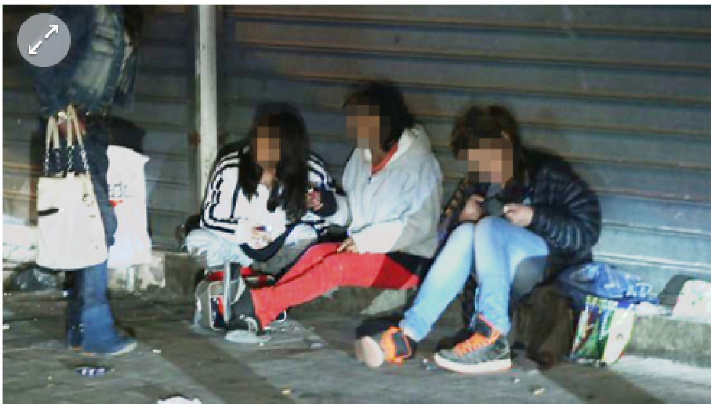
Archive (Photo: Motti Kimchi)

The report's estimates are based on ELEM's connection with some 20,000 teenagers in 2016. About a fifth of them (3,811 teenagers) were homeless or living in places other than their homes. Among them, 231 were living in a dangerous place or with a stranger in return for sexual favors.